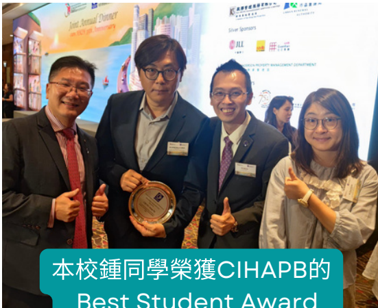
本校鍾同學榮獲CIHAPB的 Best Student Award